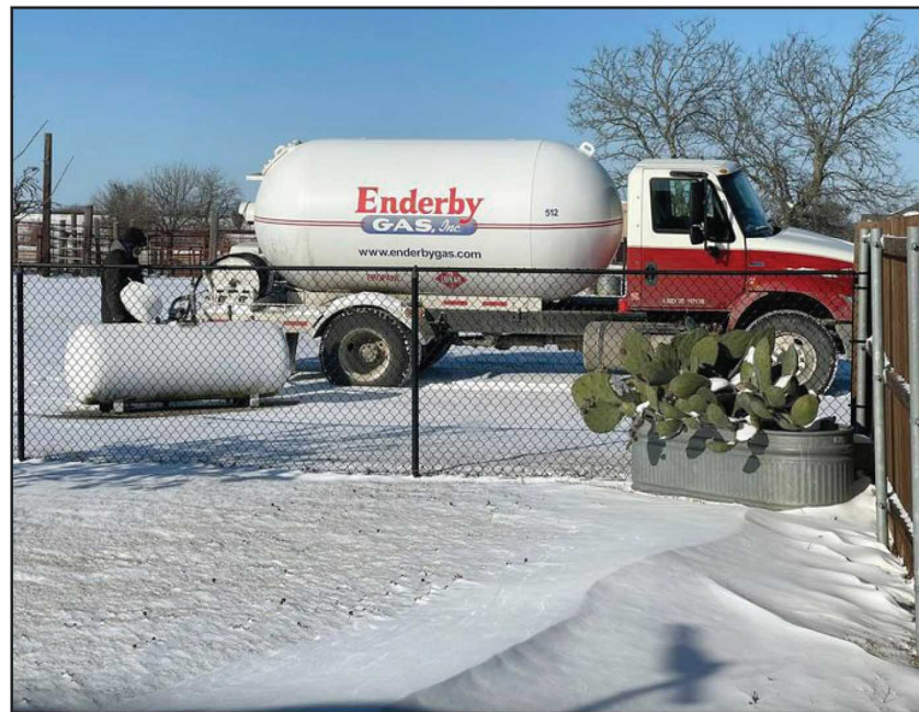
Enderby Gas fills a resident's tank in the Krum area. They are meeting customers higher usage needs because of the electrical rolling blackouts.