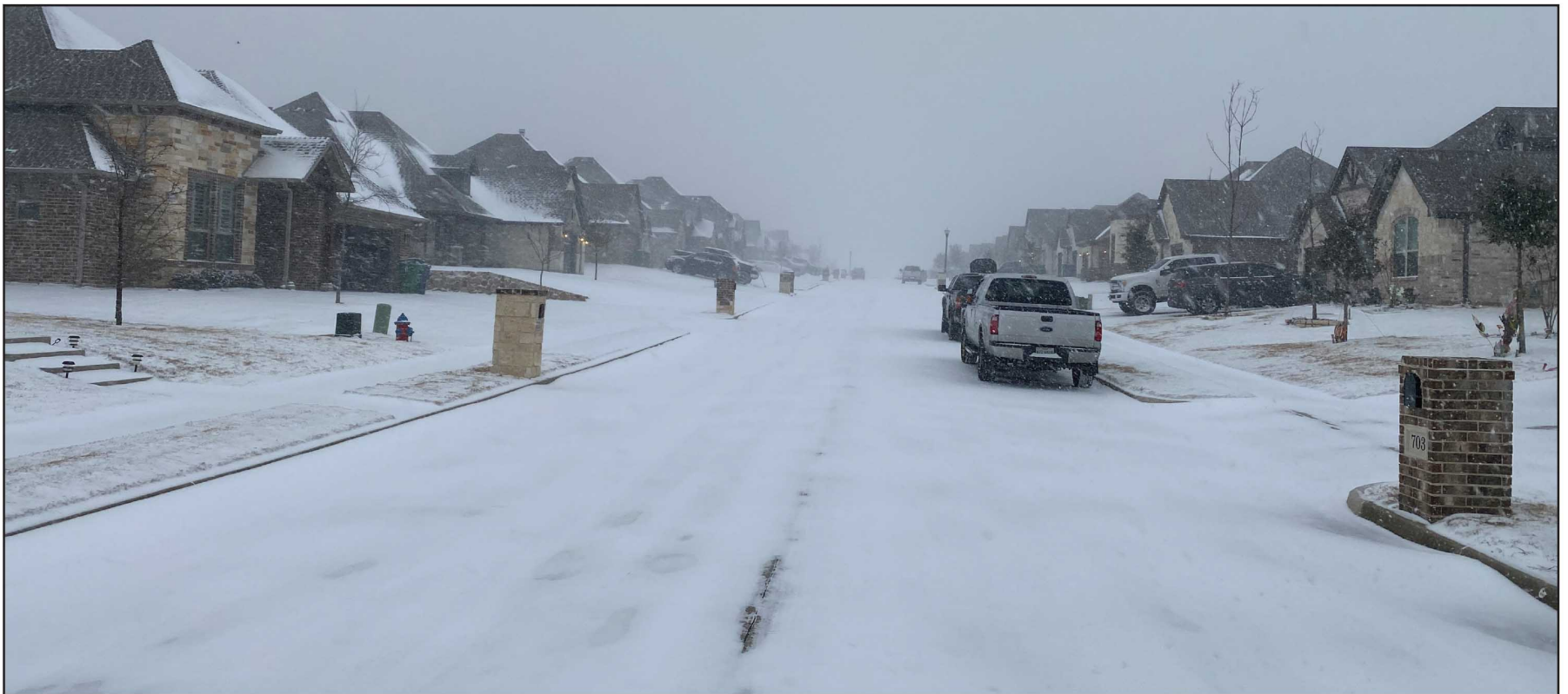
The snow starts to stick on Sunday afternoon at Ranger Creek in Sanger.