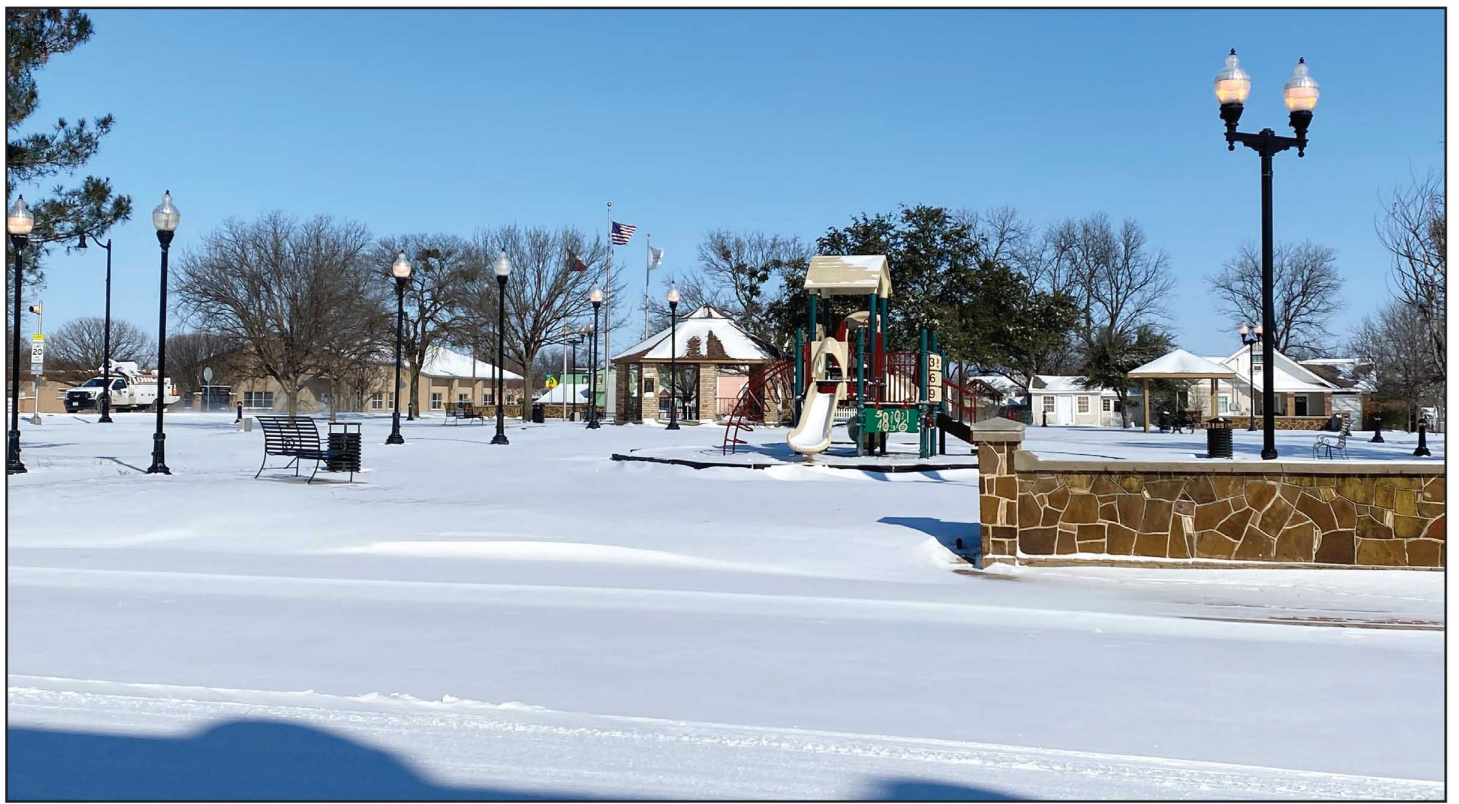
TOP: A man drives an ATV on 5th Street in Sanger on Monday morning. ABOVE: The downtown park and streets are covered with the snow. It was zero degrees and -17 windchill on Tuesday morning. MORE SNOW PHOTOS ON PAGES 4-5 and 10: