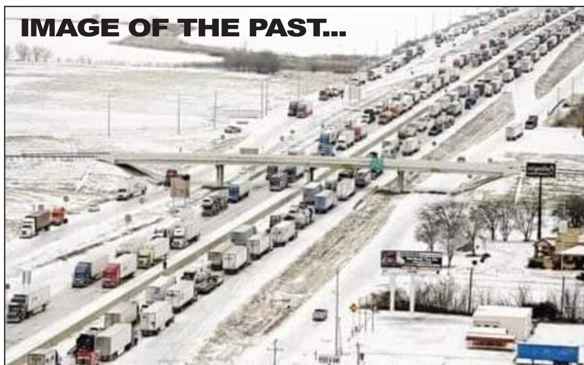
On December 6, 2013 the icy roads on I-35, in front of Miguelito's Restaurant, left vehicles, mostly 18-wheelers, stranded over night for miles along the Sanger highway.

sions and disagreements. As an alternative, you can hire a professional trustee – someone with the time, experience and neutrality to make appropriate decisions and who can bring new ideas to the process.